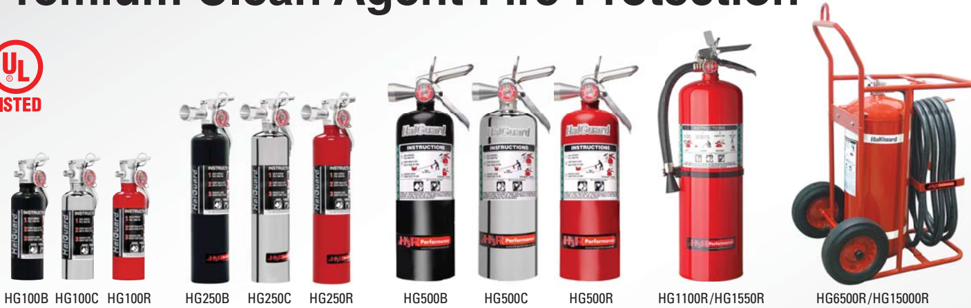
HG100B HG100C HG100R HG250B HG250C HG250R HG500B HG500C HG500R HG1100R/HG1550R HG6500R/HG15000R