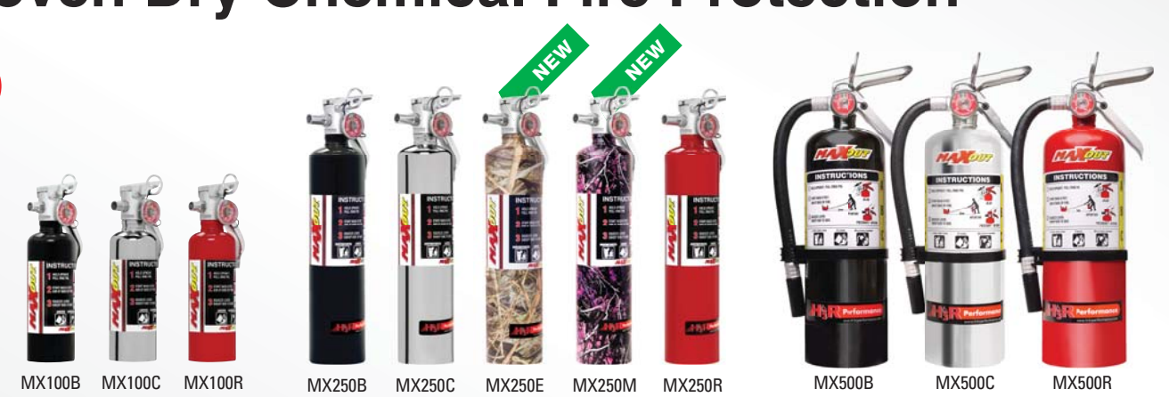
MX100B MX100C MX100R MX250B MX250C MX250E MX250M MX250R MX500B MX500C MX500R